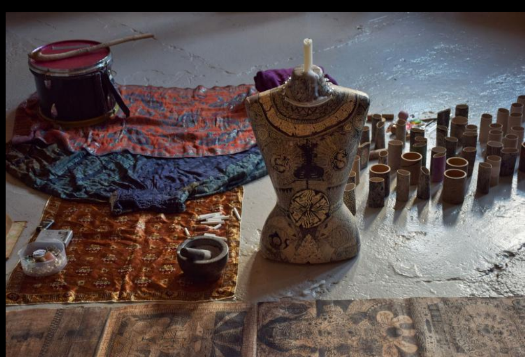
AMOK19C, Spanien19c Aarhus, 2017

Installation of drawings and objects as a stage for investigating rituals and drumming.