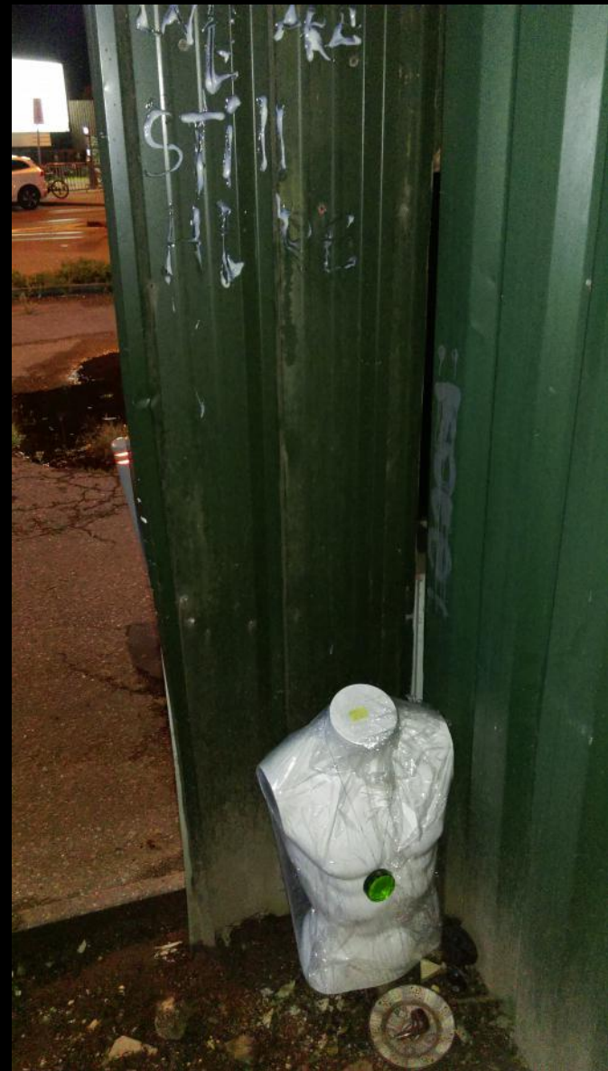
Surburban altars, Antwerp sep. 2019 Installation of sculptures and objects in public Spaces in Borgerhout, Antwerp.