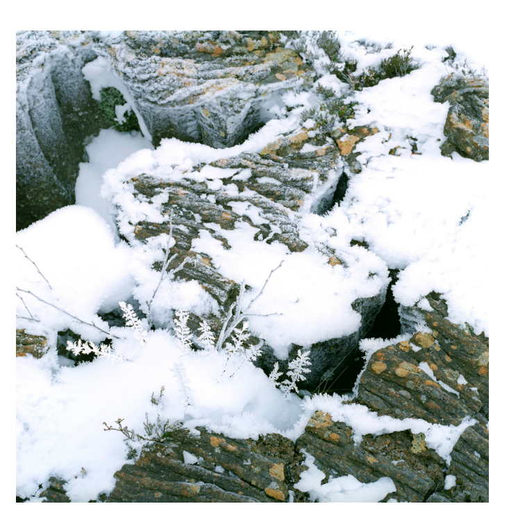
"Whiteout, Iceland # 5". 2019. White paper sculpture, analogt c-print, 75 x 75 cm. Edition 5 + 1.