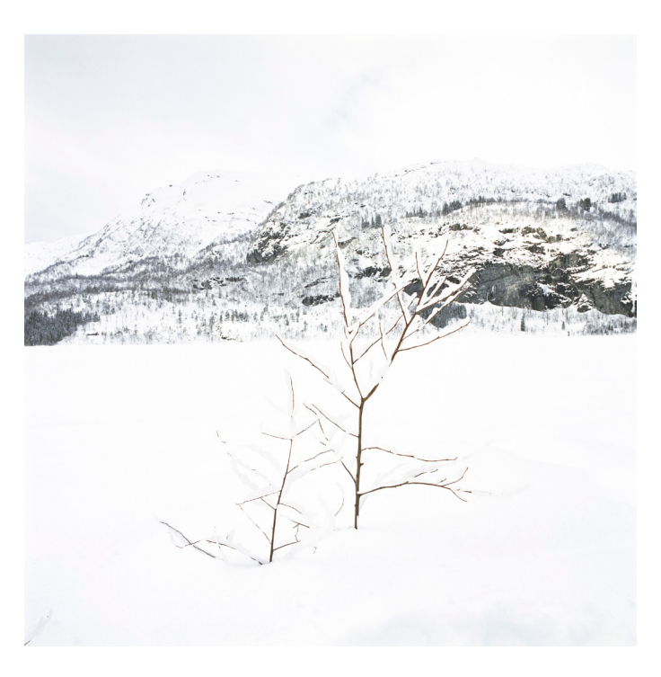
"Whiteout, Norway # 4". 2019. White paper sculpture, analogt c-print, 75 x 75 cm. Edition 5 + 1.