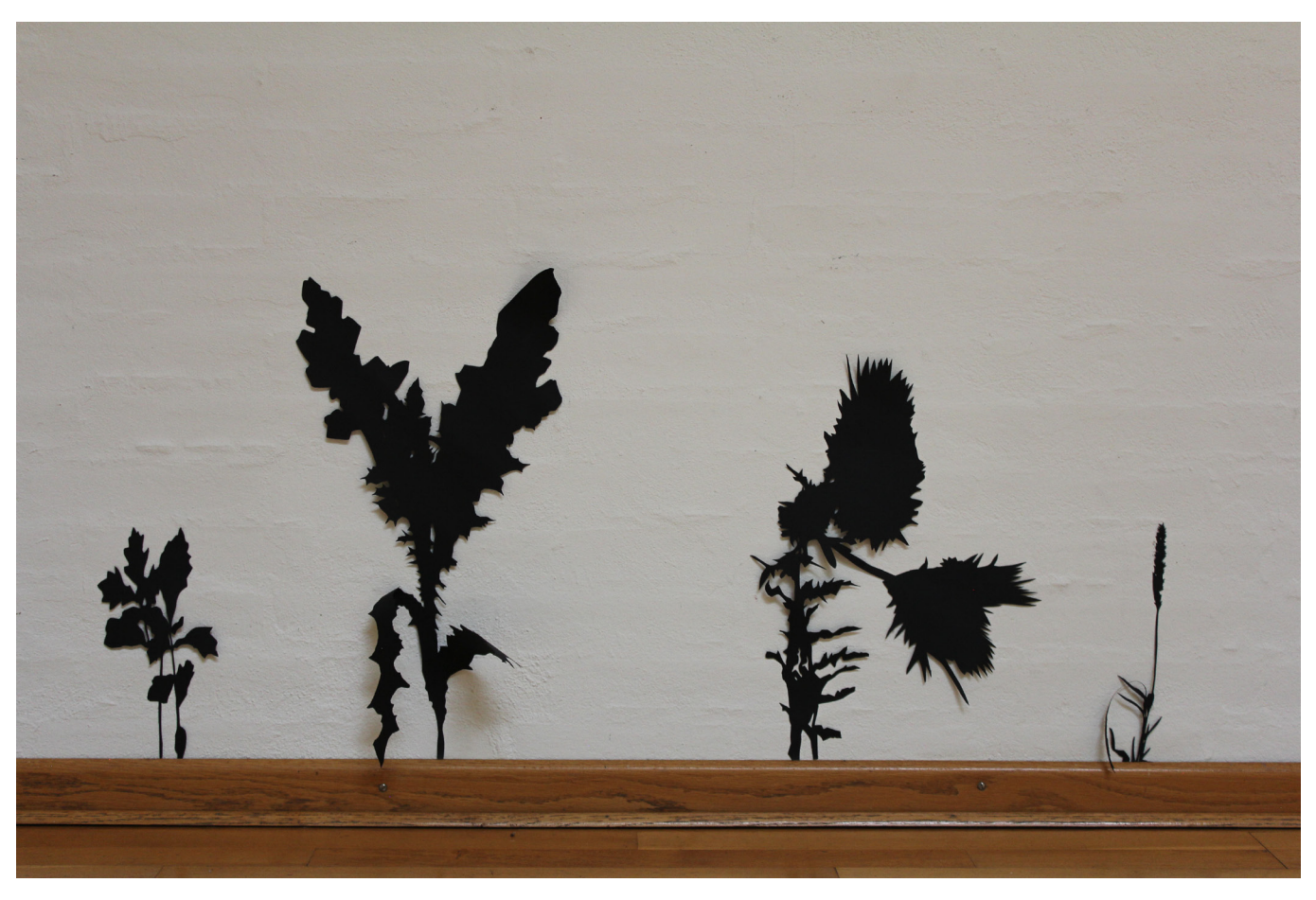
"Shadow Herbarium, Mikkelberg". 2020. Collection of paper cutting.