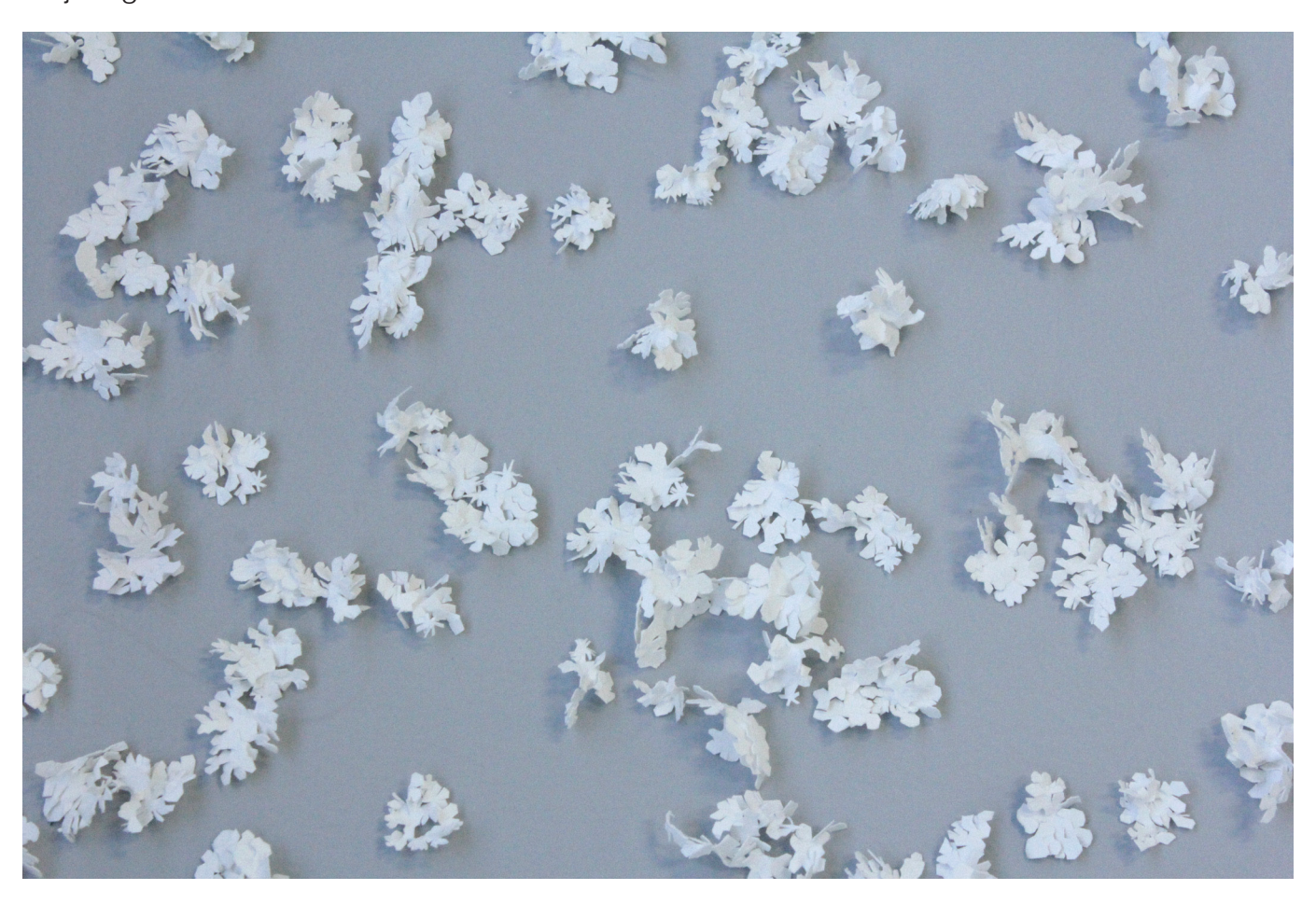
"One Thousand Snowflakes", detail of 1000 paper snowflakes in display. 2019.