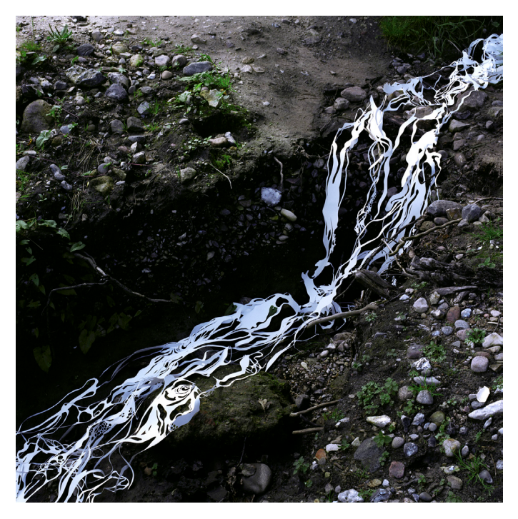
"The Ballehage Beach, Aarhus." 2017. Edition 5 + 1. White paper sculpture, analogt c-print, 75 x 75 cm.