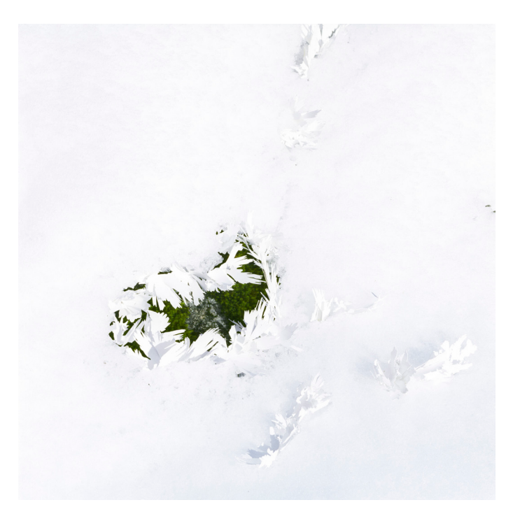
"Whiteout, Norway # 3". 2019. White paper sculpture, analogt c-print, 75 \times 75 cm. Edition 5 + 1.