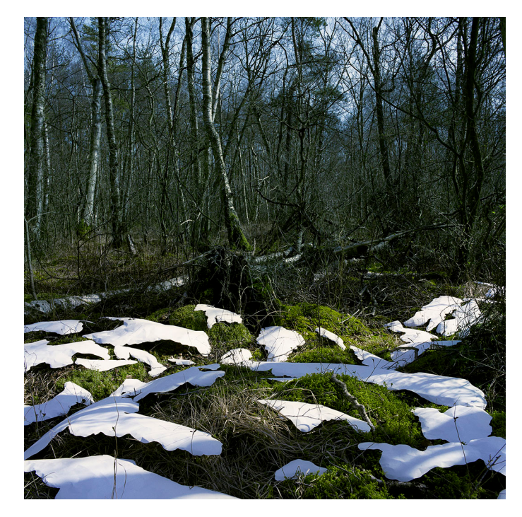
"The Ancient Forest, Moesgaard, Aarhus." 2017. 5 + 1. White paper sculpture, analogt c-print, 75 x 75 cm.