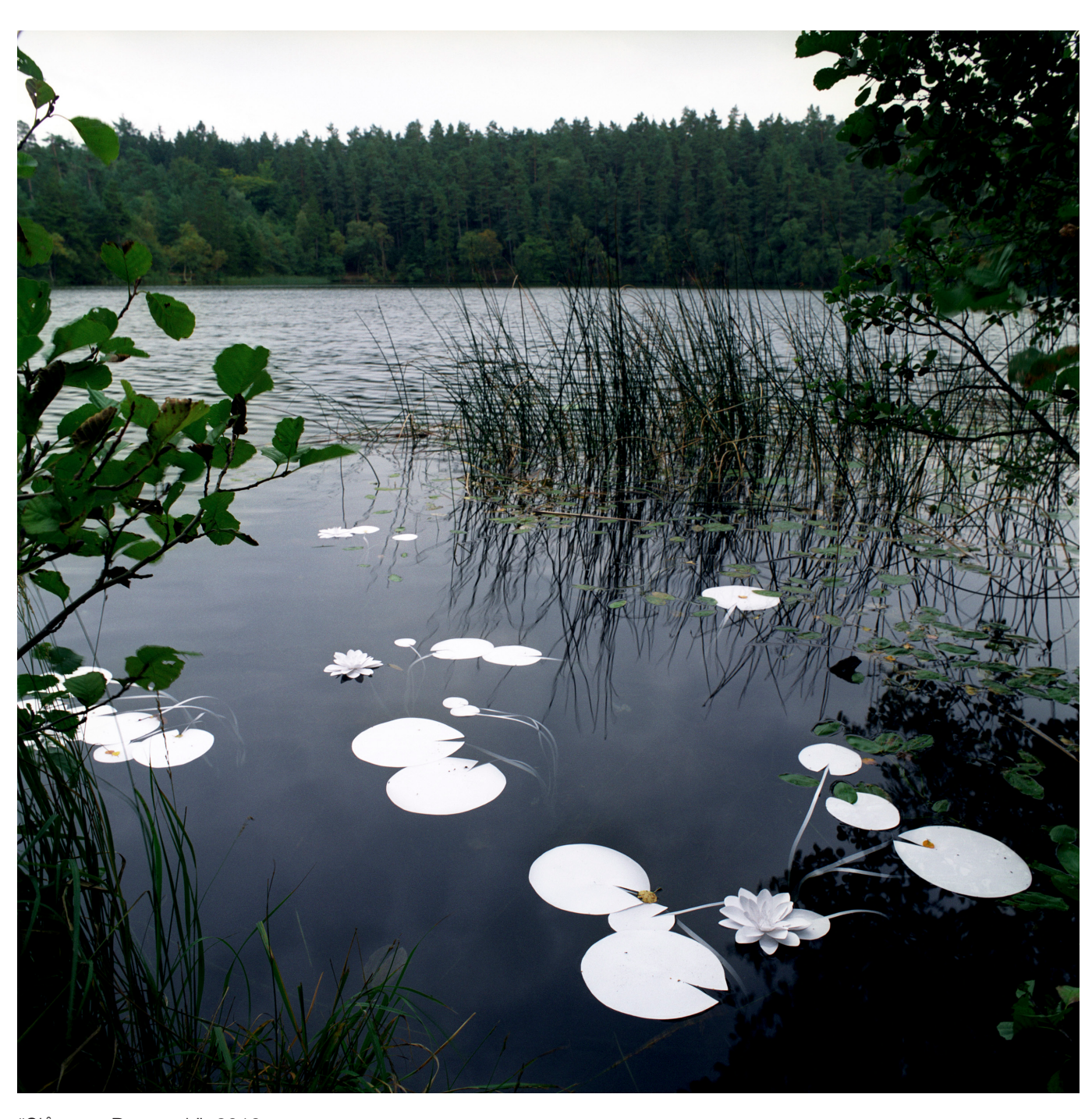
"Slåensø, Denmark". 2010. White paper sculpture, analogt c-print, 75 x 75 cm. Edition 5 + 1.