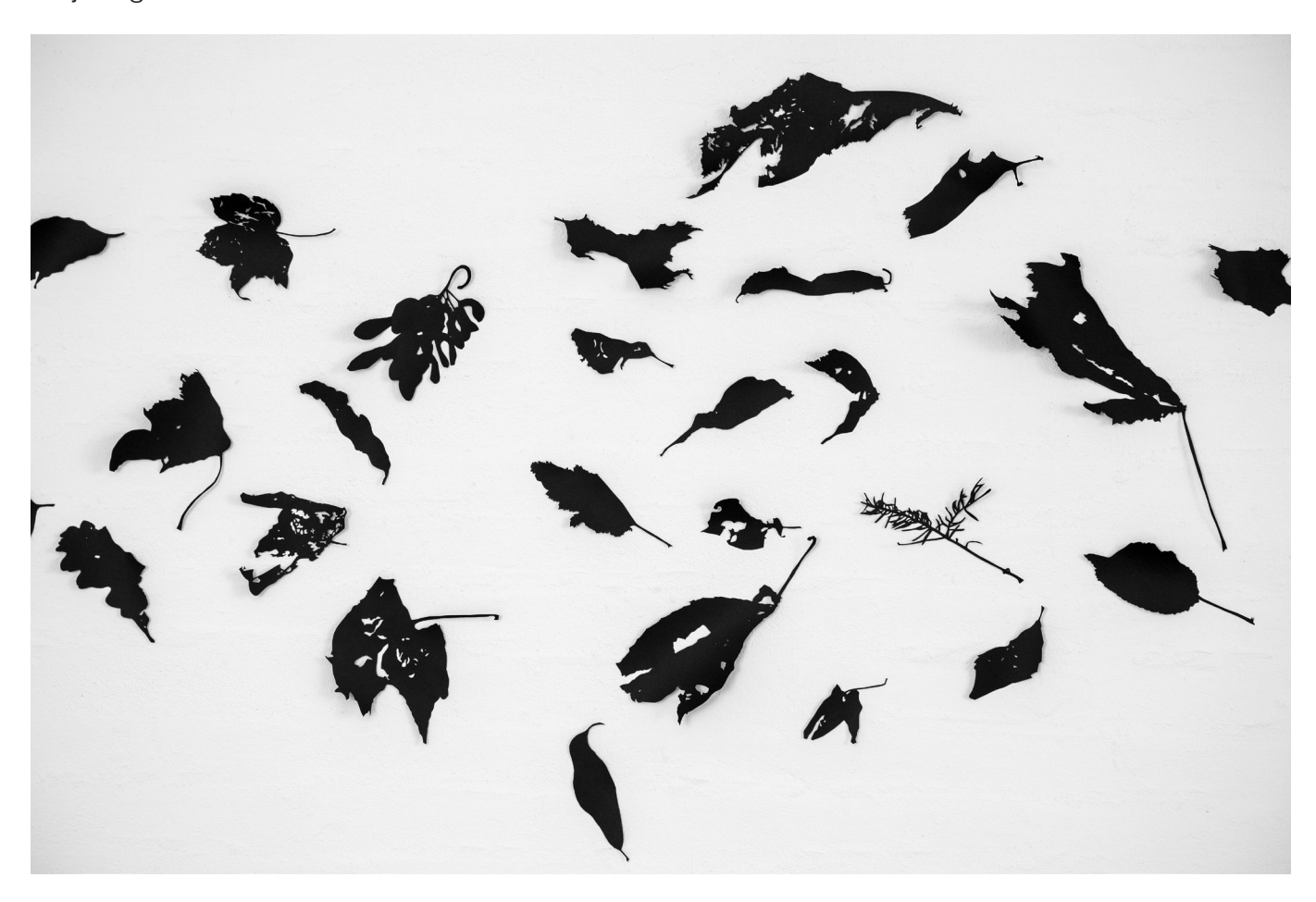
"Summer Shadow Leaves, Denmark", one hundred paper shadows in wall installation.