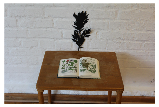
""Flora Shadow"", 2020 papercutting, florabook, dryed plants, table.