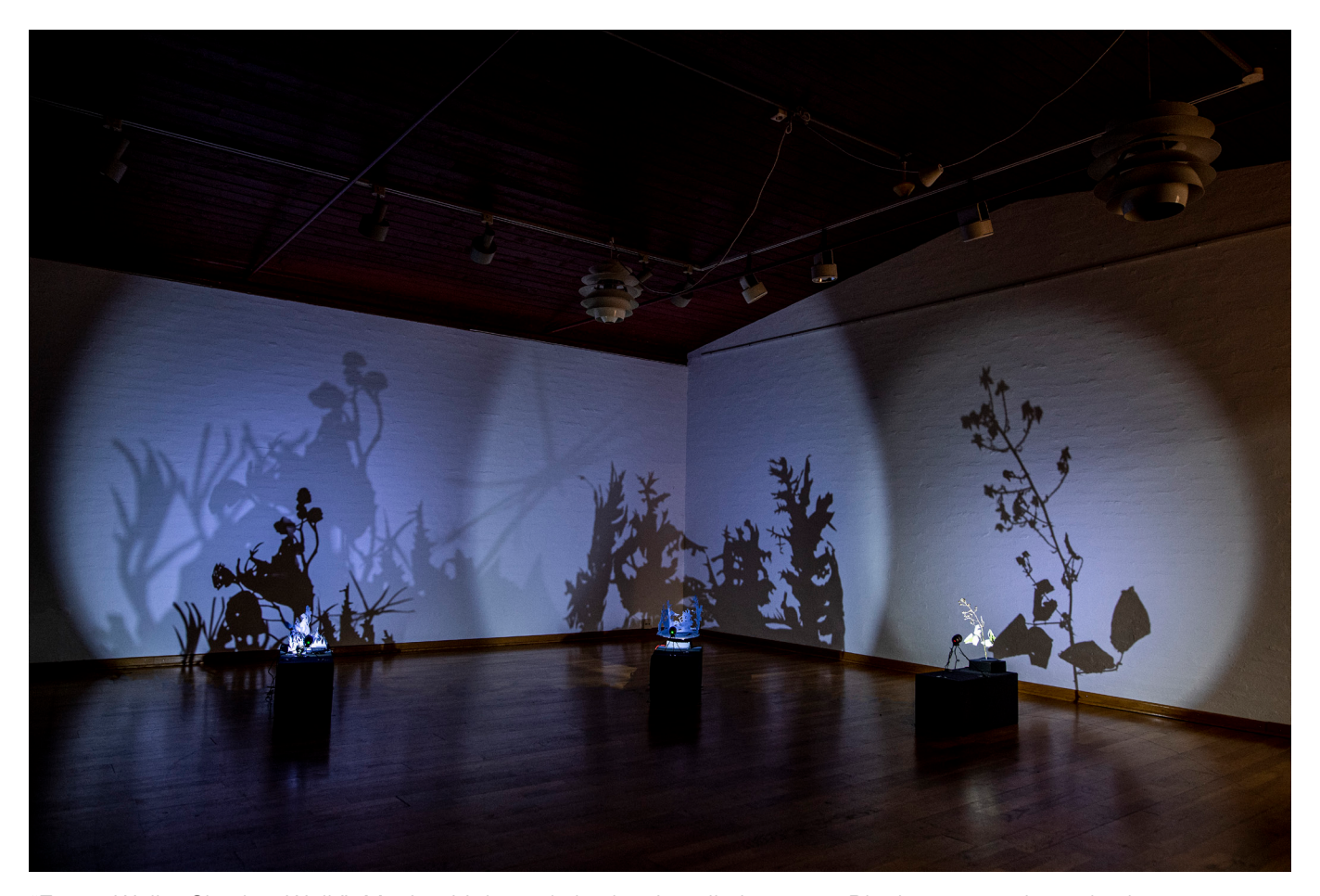
"Forest Walk - Shadow Walk", Moving Light and shadow installation 2020. Black paper cutings shadows, Blackberry branch, motors, flashlights.