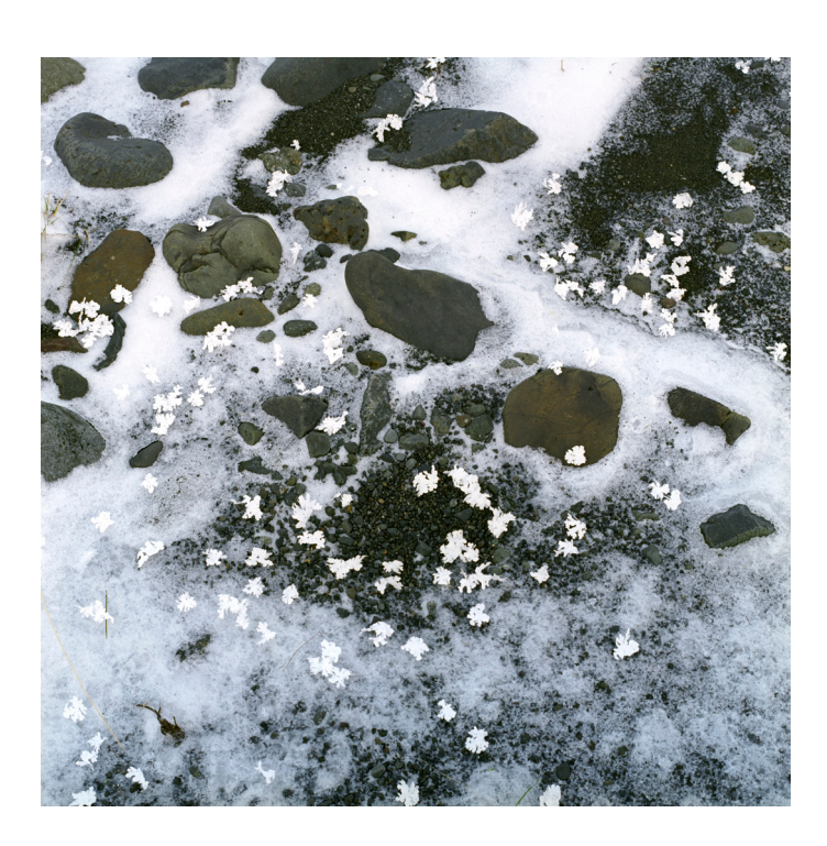
"Whiteout, Iceland" # 6". 2019. White paper sculpture, analogt c-print, 75 x 75 cm. Edition 5 + 1.