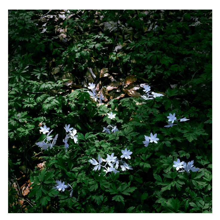
"The Marselisborg Forest, Aarhus." 2017. Edition 5 + 1. White paper sculpture, analogt c-print, 75 x 75 cm.