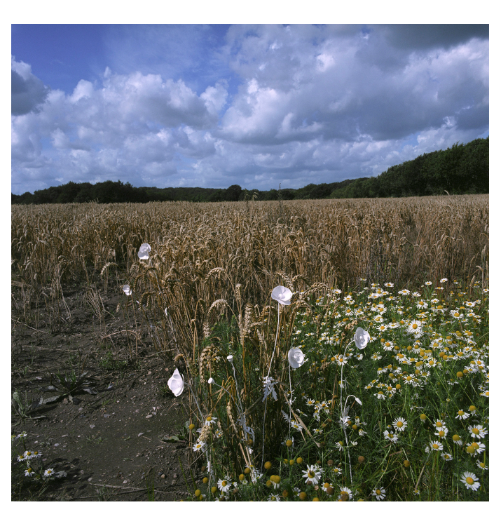
"The Borum Field, Aarhus." 2017. Edition 5 + 1. White paper sculpture, analogt c-print, 75 x 75 cm.