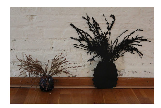
"Vessel and Heather Shadow", 2020 papercutting, vessel, heather.

These moments I collected and made into a work of a black papercutting to value this in a poetic and meditative way. The work reflected my thoughts about life and nature as a vulnerable within the threat of loss and change.