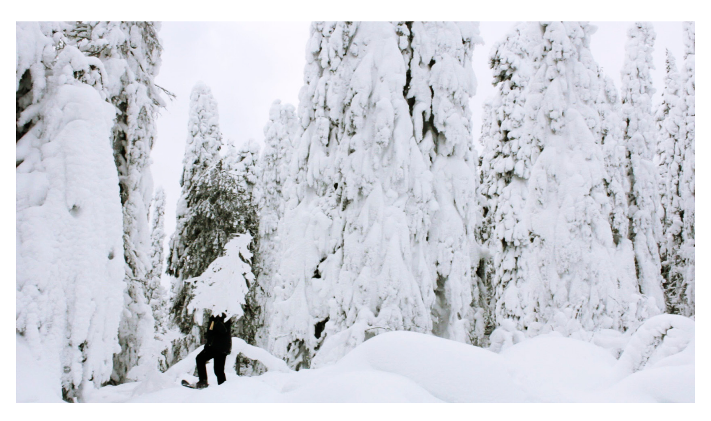
"Snow Parade", 2019, videostill, video 6 min.