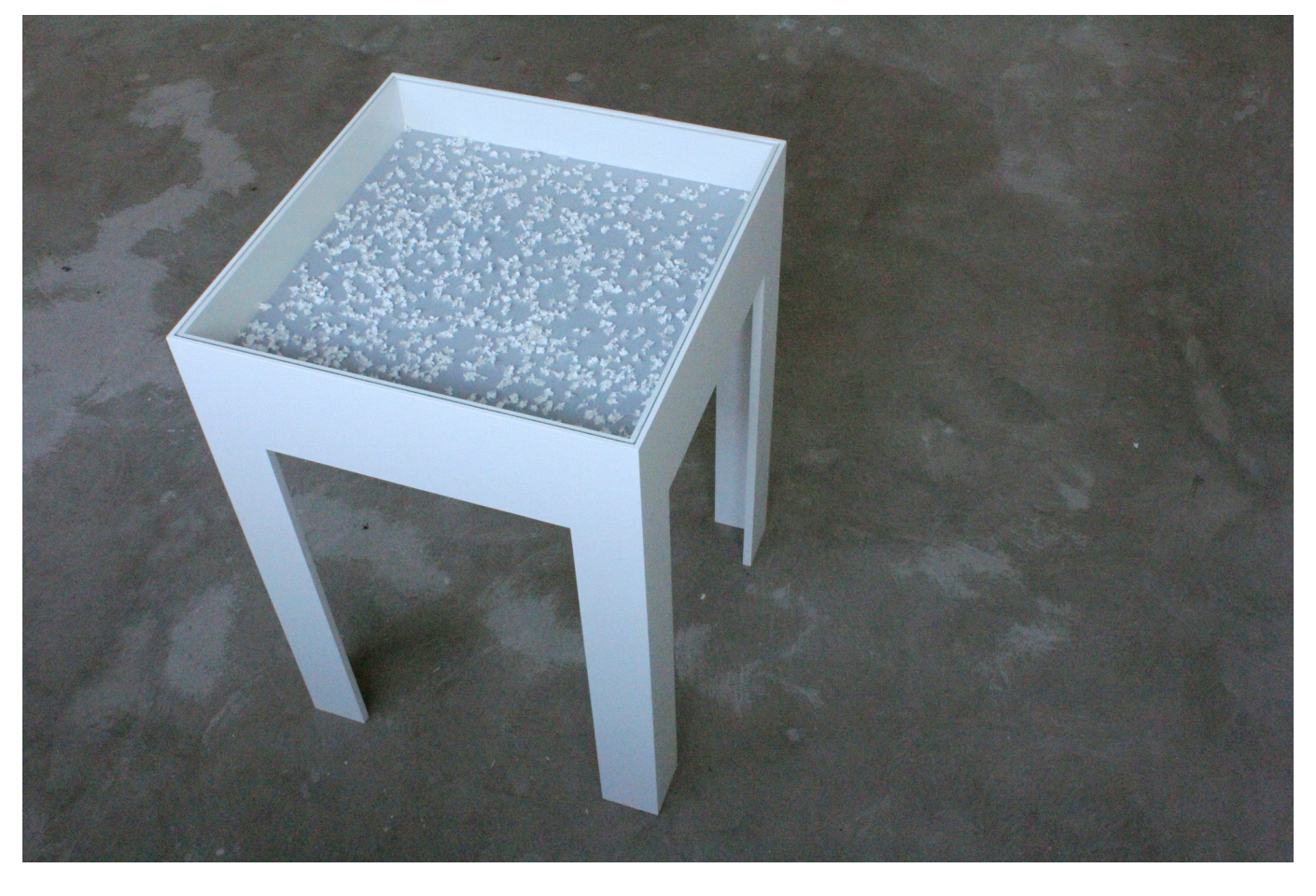
"One Thousand Snowflakes", 1000 paper snowflakes in display. 2019.