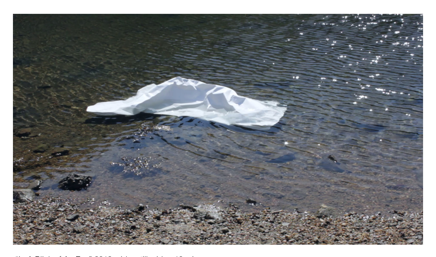
"In A Blink of An Eye" 2019, videostill, video 10 min.

Solo exhibition at; KH7artspace, Denmark, 2019.