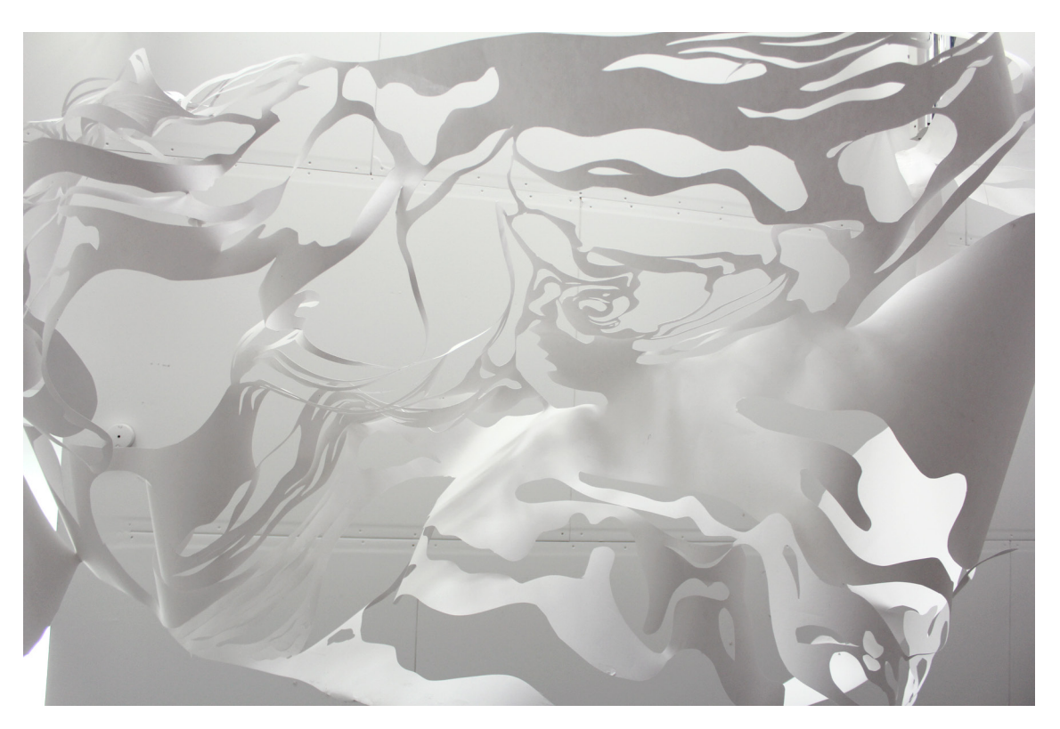
Experiments with paper cut water surface for hanging in the ceiling of the installation.