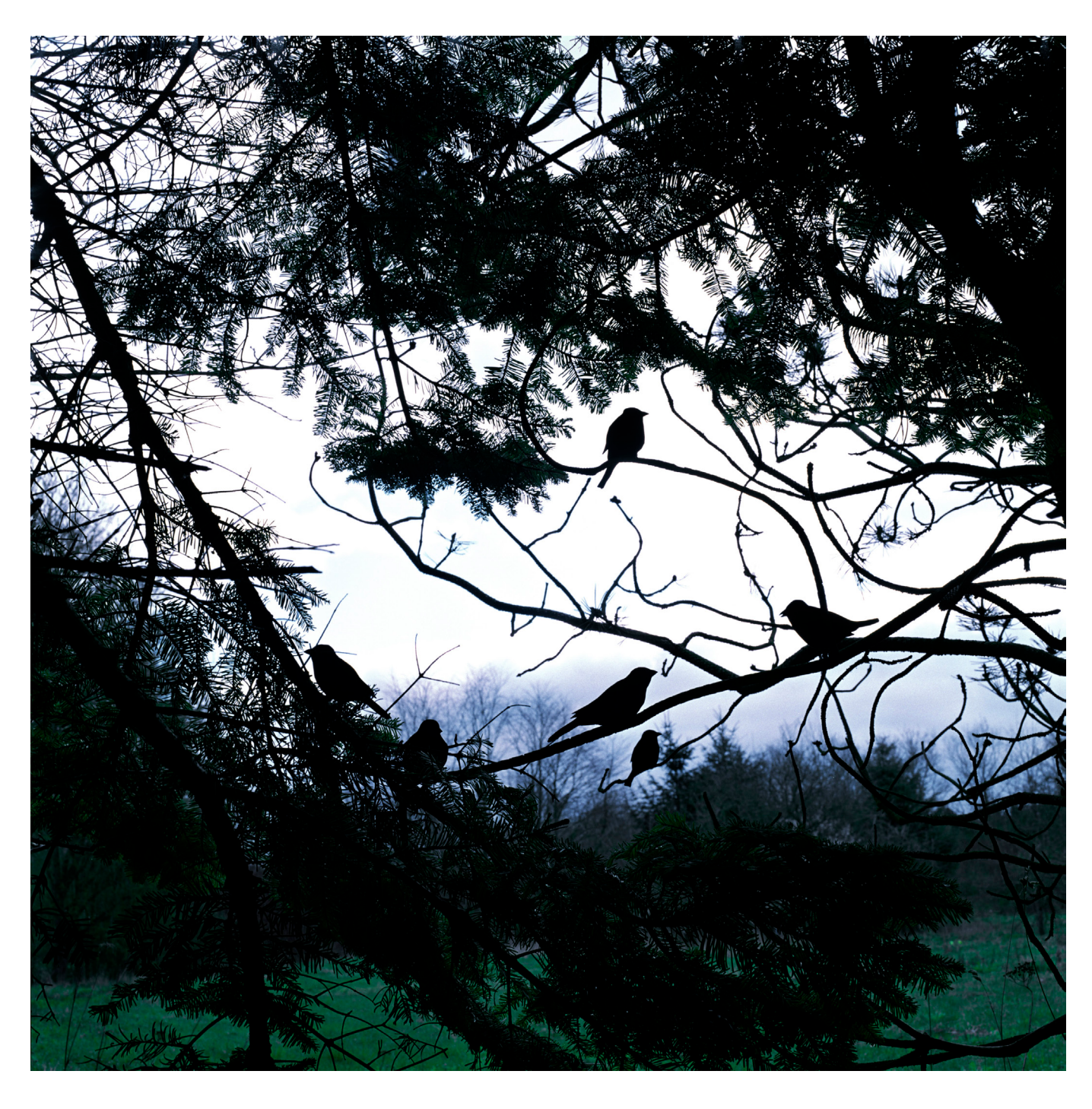
"Blackout, Denmark, #1". 2019 Black paper sculpture, analogt c-print, 75 x 75 cm. Edition 5 + 1.