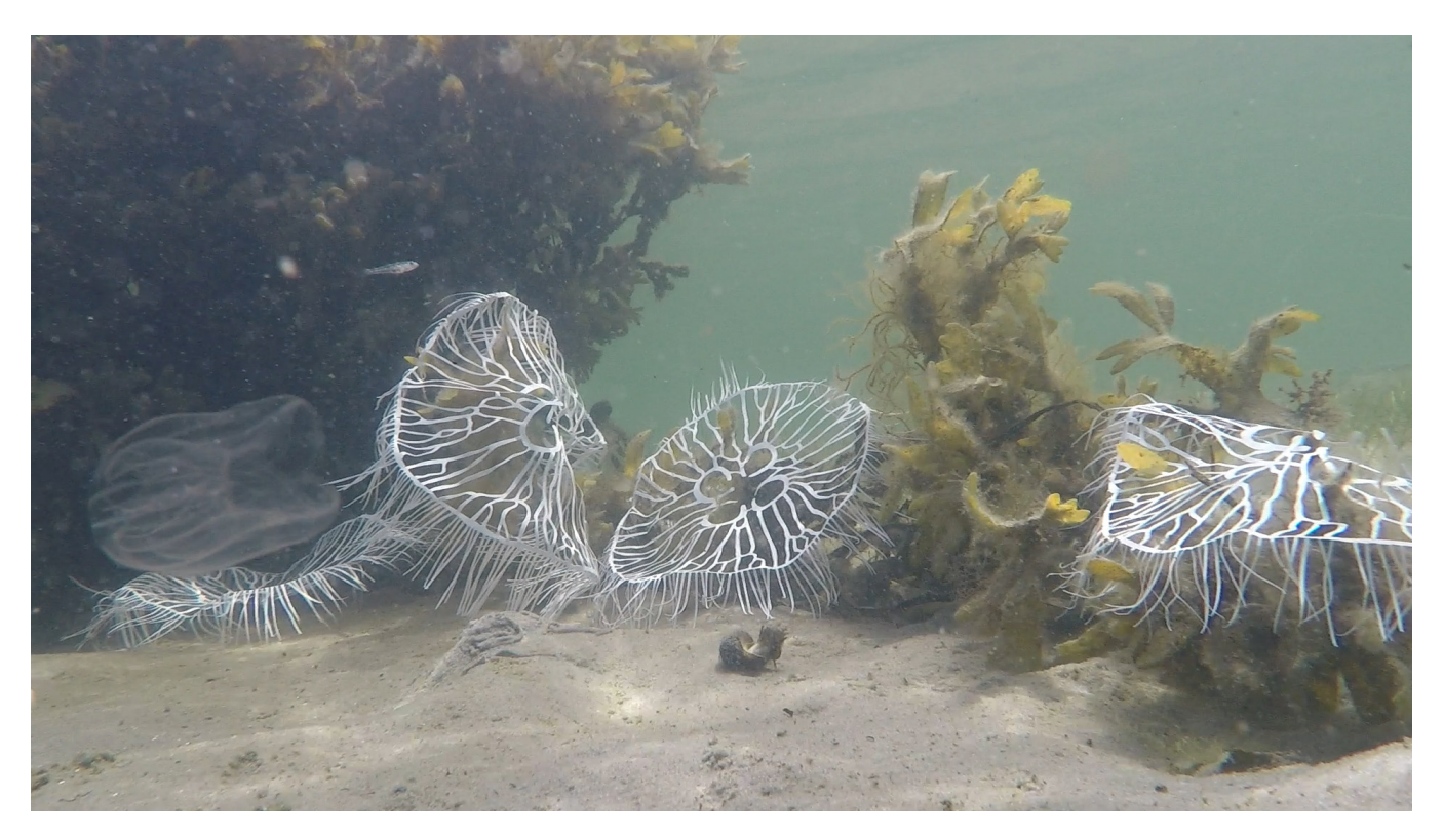
Videostill. Attempts with paper cuttings and underwater video takes.