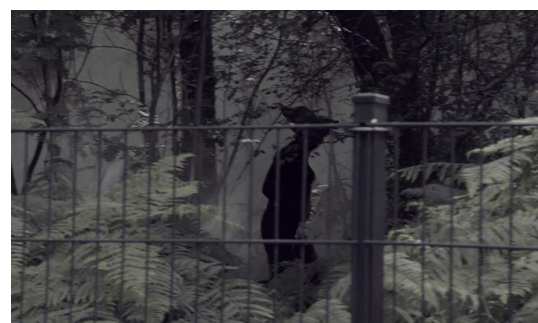
Stills from ATLAS and AT THE FENCE 2019