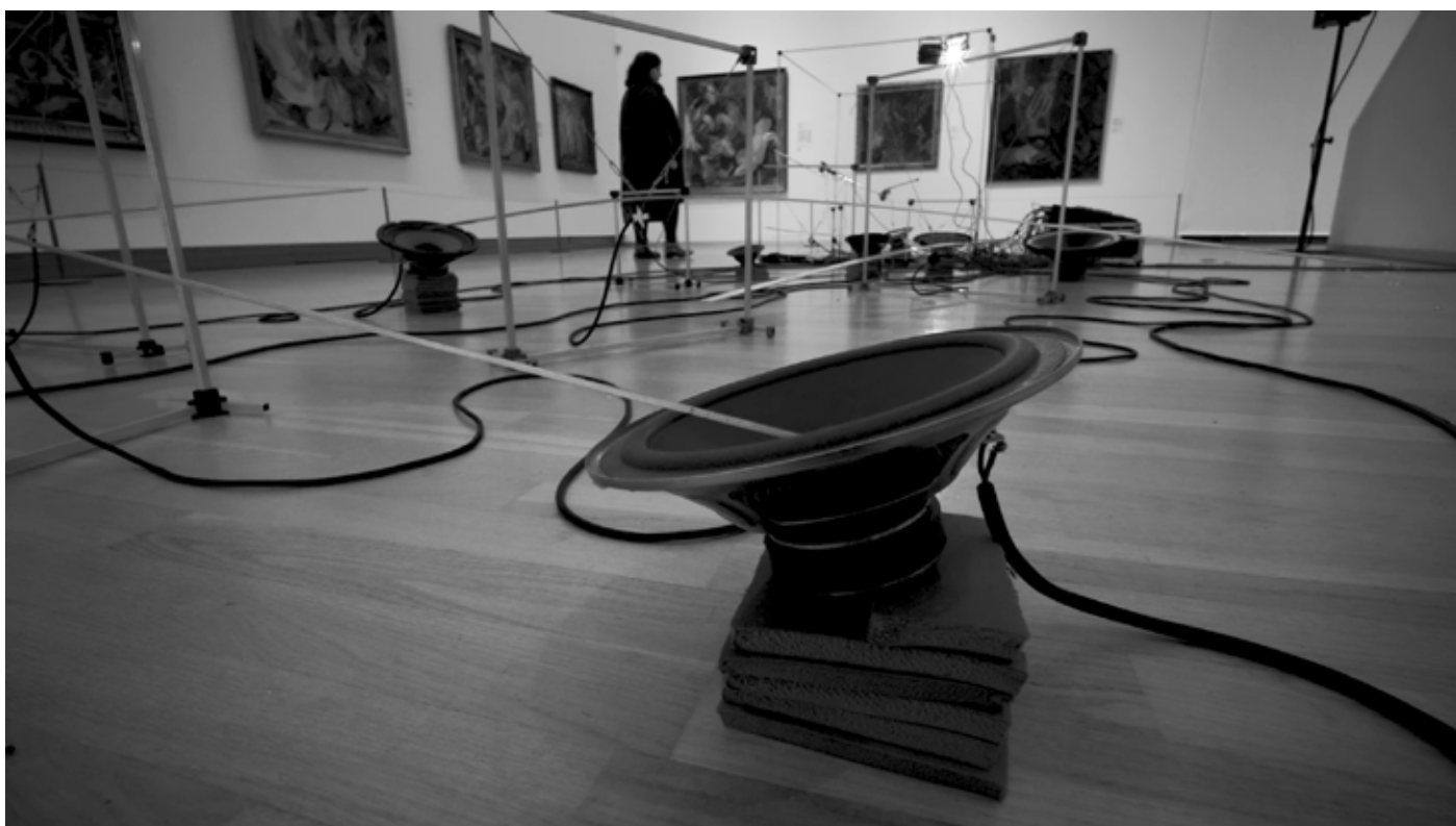
Element 13 at the National Gallery of Denmark (SMK).