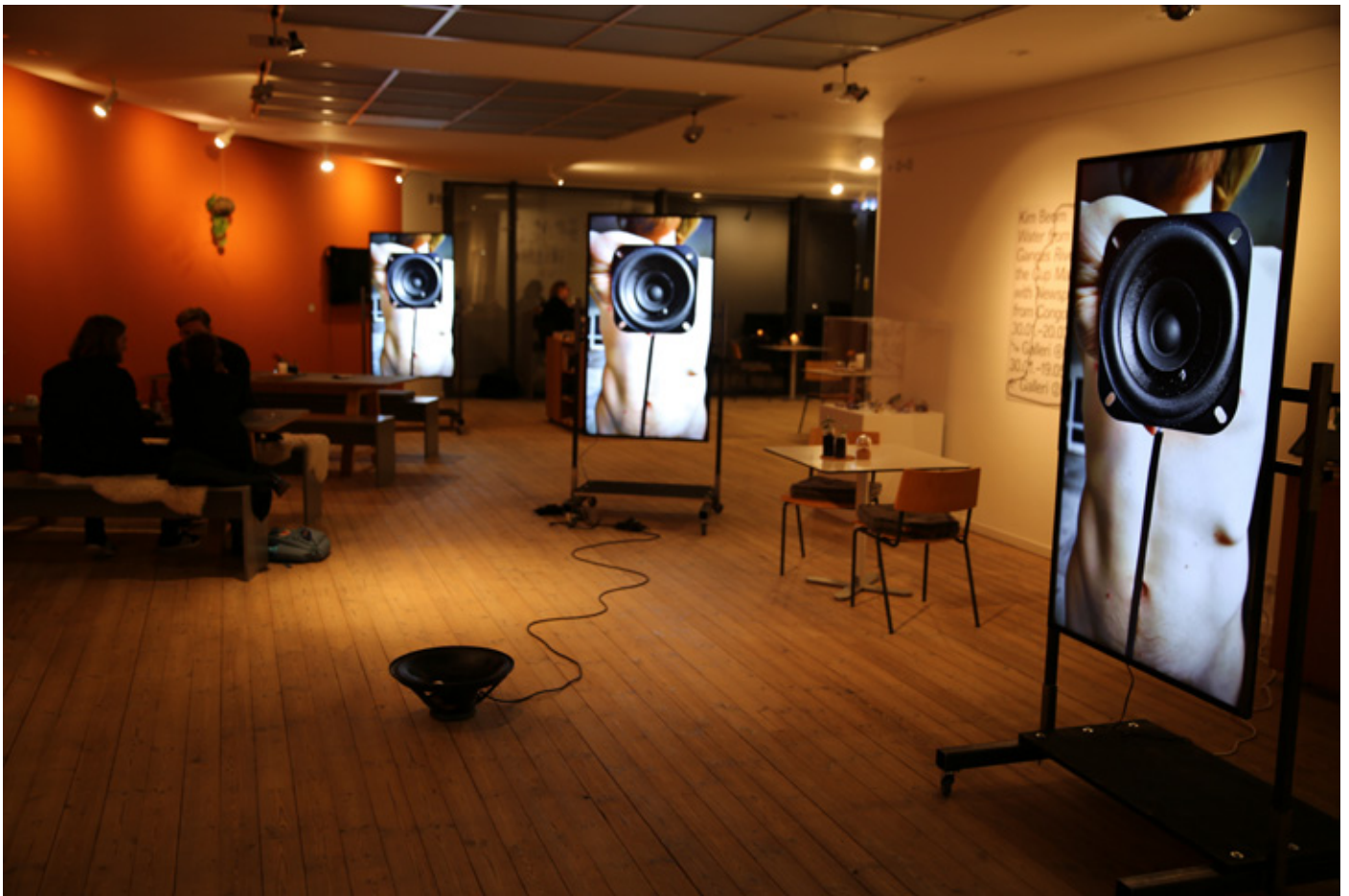
Debut video installation at Kunsthall Aarhus

The project was supported by Oticon Foundation and Danish Composers' Society.